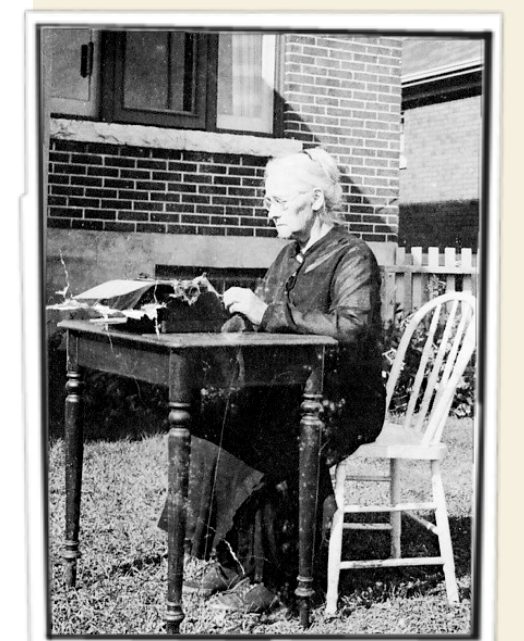
The author's great grandmother was a writer. That explains something, don't you think?

employer's behavior. Nevertheless, we can't control their behavior. We can only control our own. We can shrug off the things we don't understand, and focus instead on behaving in ways that foster positive, inclusive, productive, honest results. A Mystery, in Christian theology is what God knows and humans can not, but must believe . Secrecy is what is known, but not to everyone. Privacy is what allows us to keep what we know to ourselves. Some things begin as a Mystery, then become Secret and after that, Private Matters. Like conception. Like POStPlan. What we feel about the current postal situation is a private matter. Sometimes even we don't know what we think or feel about it, and we're not allowed to say, at least in public. But finding out what we really think and feel, which is something a lot of us did at convention, about the prospect of a completely changed career trajectory allows us to connect with others on a basis of respect rather than fear, and to link with those who feel differently. When we know where we are starting from, we can control what is in our control, implement what we can implement and leave the rest to higher powers.