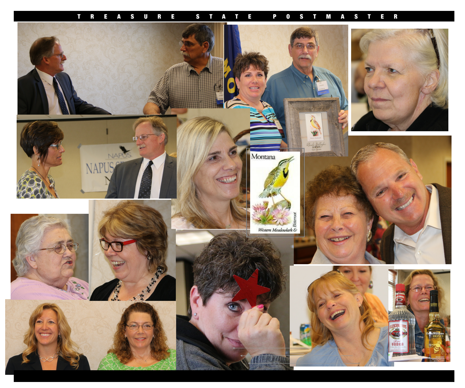
Wow! We had some real WINNERS in the Foot-or-a-Pound Auction!